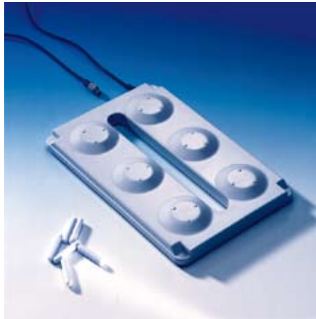
Inductive stirring system ET 606

The microprocessor-controlled Lovibond® inductive stirring system is non-wearing and maintenance-free. In other words, there are no moving parts in the system.