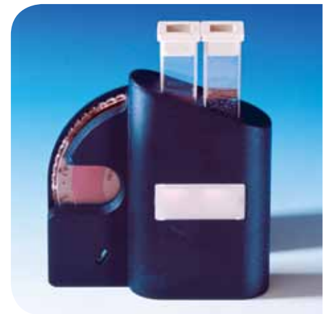
Rear view of the CHECKIT®Comparator with disc, diffuser and cells