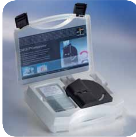
Test Kit complete in case