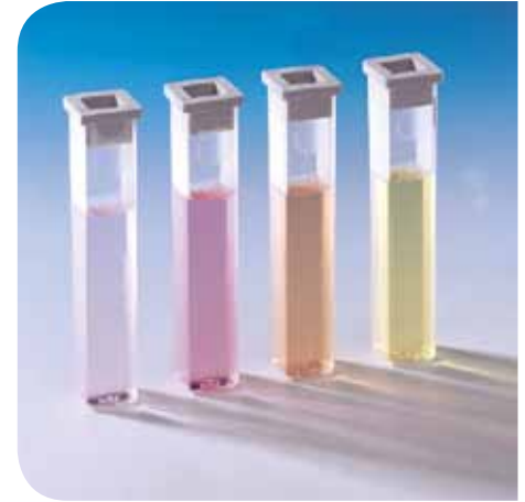
Plastic cells, frosted on two sides, volume 10 ml, path length 13.5 mm, with lid