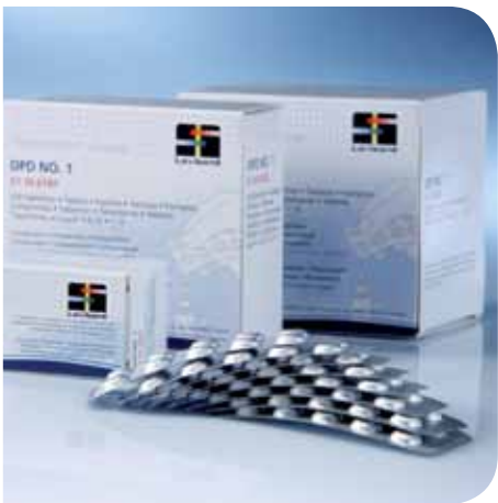
Tablet reagents in foil blister strip