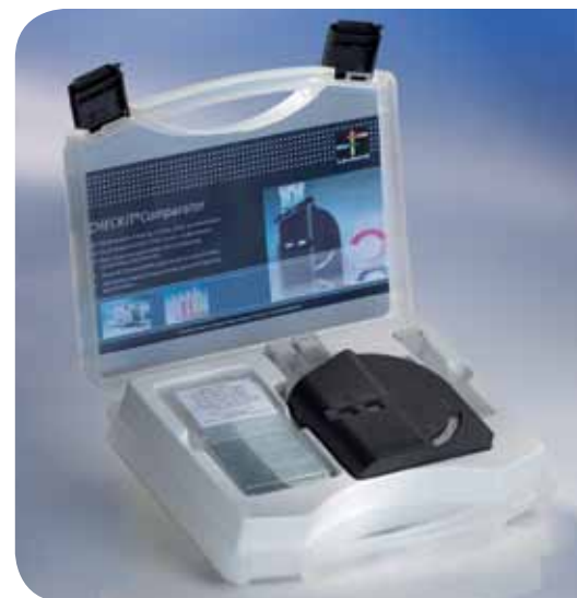
Test Kit complete in case

Material Safety Data Sheets: www.lovibond.com