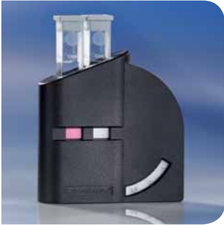
Front view of the CHECKIT®Comparator with cells