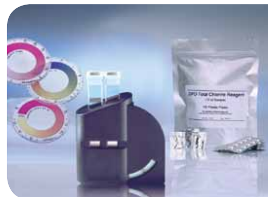
CHECKIT®Comparator with powder reagent/ tablets

Material Safety Data Sheets: www.lovibond.com