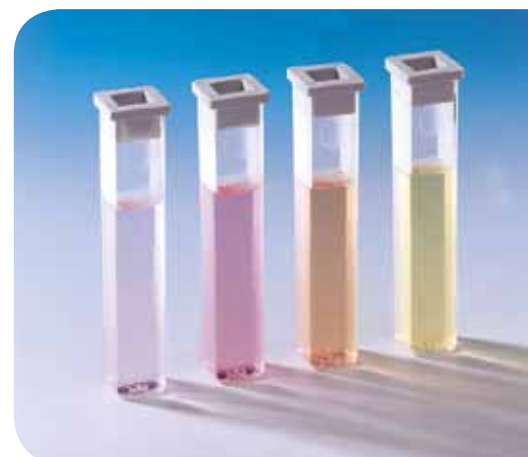
Plastic cells, volume 10 ml

Material Safety Data Sheets: www.lovibond.com